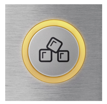
Motor will operate pre-programmed sequence to crush ice easily with the touch of a button